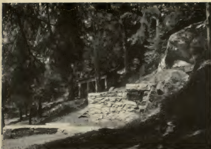
OUTDOOR THEATRE. DARTMOUTH